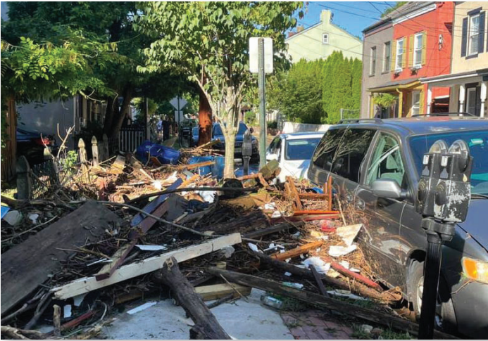
Lambertville, New Jersey

Fund helps employees affected by Hurricane Ida